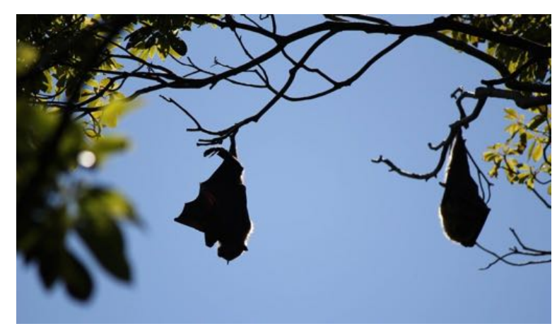
Flying-foxes

REPORT IT TO YOUR LOCAL WILDLIFE SERVICE, VET OR BAT CARER GROUP