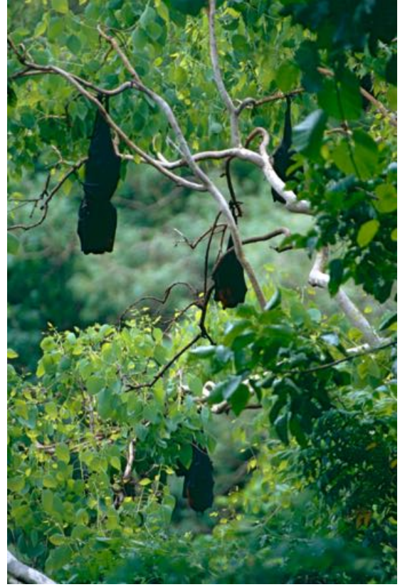
Black flying-foxes