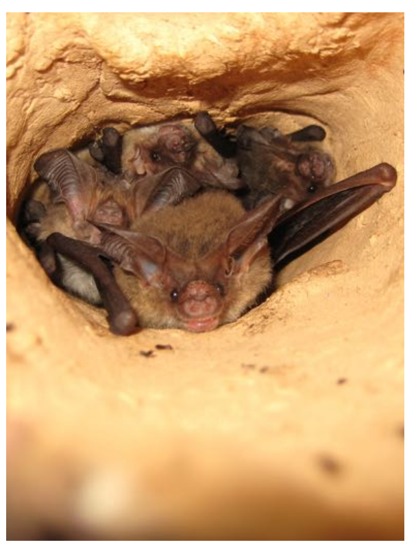
Gould's long-eared bat

In addition, 213 oral swabs from live bats were tested for ABLV for research purposes between September 2015 and March 2017, and retrospectively reported. All tested negative. Testing of live bats is not reliable for ruling out ABLV infection.