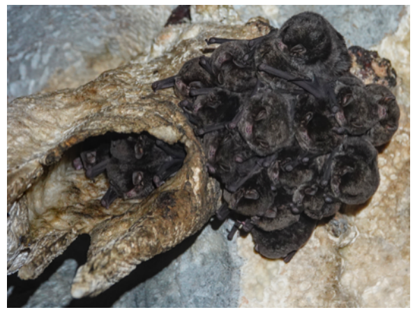
Bent-winged bats

Potentially infectious contact with humans was reported for eight of the ABLV infected flying-foxes reported. In these cases clinical advice was provided by an experienced public health official.