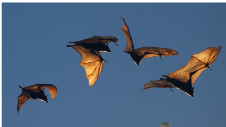
Little red flying-foxes

There are no recent surveys on the prevalence of ABLV infection in wild bats. Surveys of wild-caught bats in the early 2000s indicated an ABLV prevalence in the wild bat population of less than 1%. 2 ABLV infection is more common in sick, injured and orphaned bats, especially those with neurological signs. 3 People are more likely to have contact with bats that are unwell or debilitated, as these bats may be found on or near the ground. 4