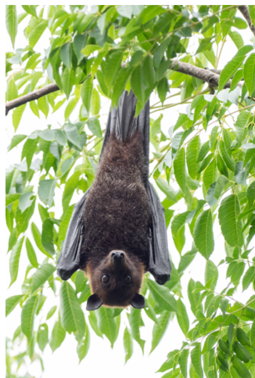
Black flying-fox