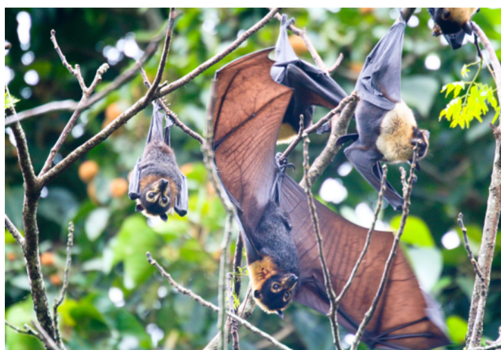
Spectacled flying-foxes

REPORT IT TO YOUR LOCAL WILDLIFE SERVICE, VET OR BAT CARER GROUP