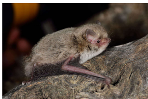
Little forest bat