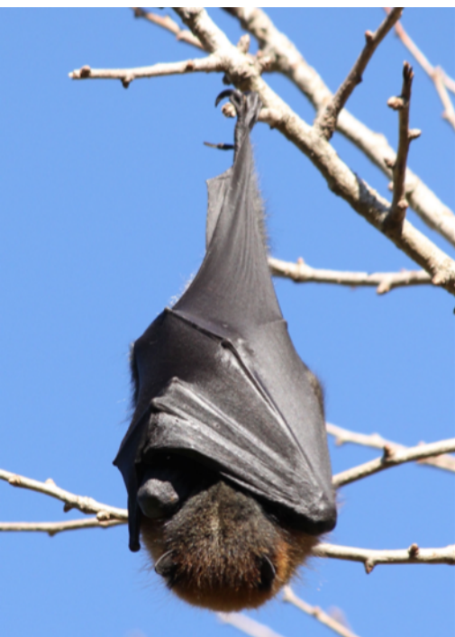
Grey-headed flying-fox