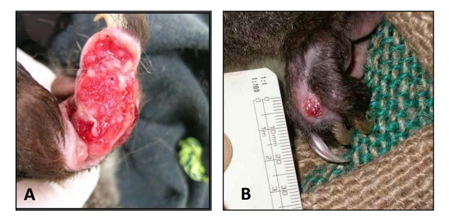
Figure 2. Mountain brushtail possum with lesion (A) at diagnosis and (B) later without treatment.

Various medical and surgical methods have been used to treat MU disease in domestic animals, including antibiotic treatment, surgical excision and cryosurgery <sup>[33-35]</sup>. In wildlife, the infection has been known to resolve without treatment, as in the case of a mountain brushtail possum from Bellbird Creek (Fig. 2) and a brushtail possum from Point Lonsdale (unpublished). In severe cases, animals have been euthanased. Human treatment is not addressed in this Fact Sheet.